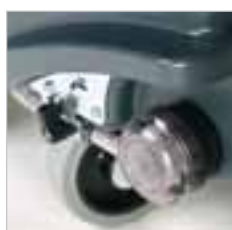
RA 505 IBC Fresh water filter easy to reach; Water supply is adjustable.