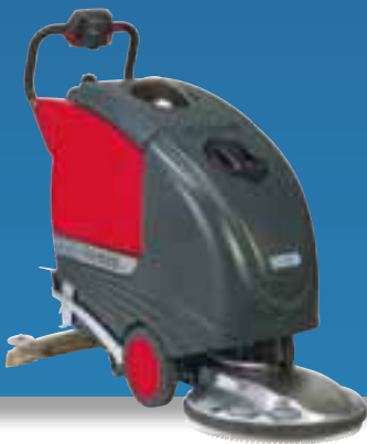
RA 505 IBC

A splendid floor. That's what Cleanfix scrubber dryers leave. But what is outstanding about this? They are easy to use, ecological and have an integrated battery charger. There is a new optionally available Cleanfix Advanced Dosing System (CADS) – with it, you can save 50% of the chemical you normally use. Another outstanding quality is that these machines are 100% made in Switzerland.