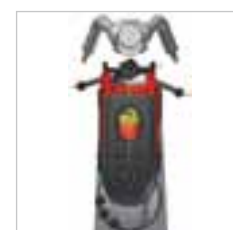
RA 505 IBC / RA 505 IBCT / RA 605 IBCT The rounded form of the machine enables clear – sighted working. The view of the brush is not obscured.