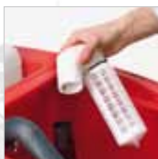
RA 505 IBC / RA 505 IBCT / RA 605 IBCT The floater with filter can easily be disassembled and cleaned. It works at the same time as over-flow protection.