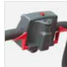
RA 505 IBC / RA 505 IBCT / RA 605 IBCT The safety lever ensures, that the machines will not work without the operator.