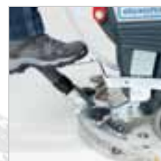
RA 505 IBC / RA 505 IBCT / RA 605 IBCT Brush unit lifting and suction bar lifting is foot operated.