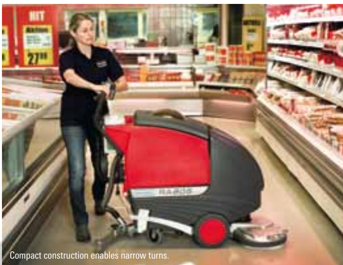
Compact construction enables narrow turns.

The RA 605 IBCT is equipped with two brushes with a \varnothing 318 mm each, which provides a 620 mm working width. It comes with traction and speed regulated solution supply. Optional CADS available. This machine is useful for larger surfaces with a gradient of up to 8%.