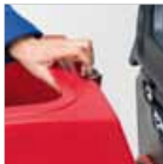
RA 505 IBC / RA 505 IBCT / RA 605 IBCT Machines are easy to open, the battery compartment is easy to reach.