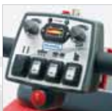
RA 505 IBCT / RA 605 IBCT Clearly laid out control panel.