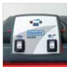
RA 505 IBC This simple control panel is easy to use