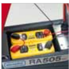
RA 505 IBC Easy access to the batteries. Single fuses for brush and suction motor.