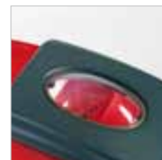
RA 505 IBC / RA 505 IBCT / RA 605 IBCT Through the gauge-glass, the operator can always see inside the tank.