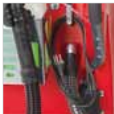
RA 505 IBC / RA 505 IBCT / RA 605 IBCT After work, just plug the charger into the wall socket. The battery charger is protected from liquid and inside the machine stays dry.