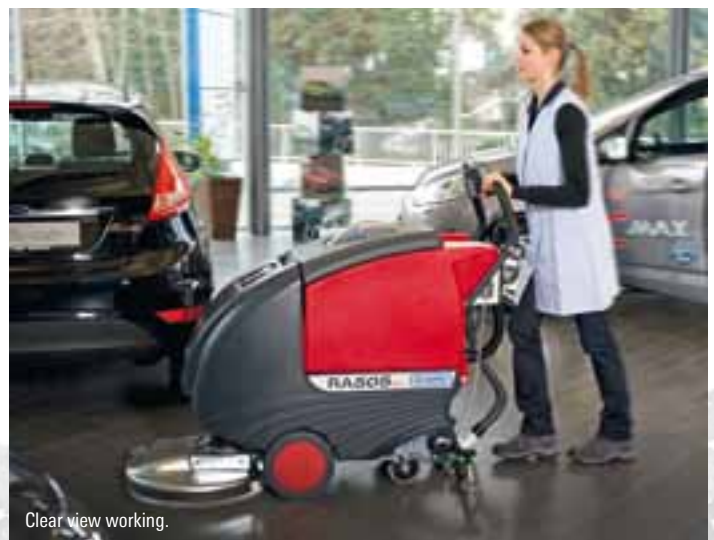
Clear view working.