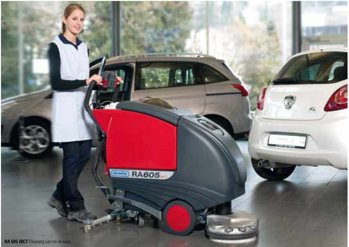
RA 605 IBCT Cleaning can be so easy