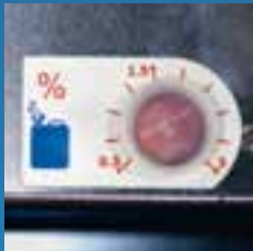
Option: Chemical dosing easy to set.