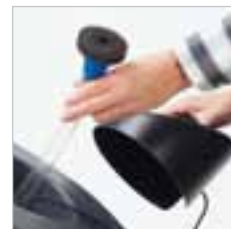
RA 505 IBC / RA 505 IBCT / RA 605 IBCT Optional filling hose is always with the machine. With this, the clean water tank can be filled from every tap.