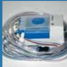
Chemical dosing CADS.