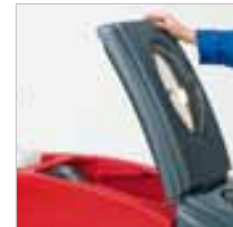
RA 505 IBC / RA 505 IBCT / RA 605 IBCT Due to the large door, the machine is easy to open and to clean.