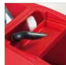
RA 505 IBC / RA 505 IBCT / RA 605 IBCT The gross dirt filter captures all gross dirt and is easy to empty and clean out.