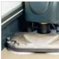
RA 605 IBCT Brush unit marginally precedes the frame. Making cleaning underneath overhangs possible.