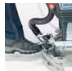
RA 505 IBC / RA 505 IBCT / RA 605 IBCT Suction unit is very easy to use.