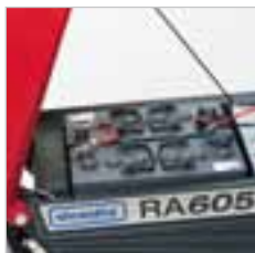
RA 505 IBCT / RA 605 IBCT Easy access to batteries. Single fuses for the brush and the suction motor, as well as for the traction.