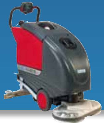
RA 605 IBCT

The RA 505 IBCT – which is also equipped with a scrubbing brush with a \varnothing 510 mm, has additional traction and the solution supply is regulated by the speed. Optionally available is the Cleanfix Advanced Dosing System (CADS). This machine is useful for middle sized surfaces with a gradient up to 8%.