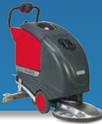
RA 505 IBCT

The RA 505 IBC is equipped with a scrubbing brush with a \varnothing 510 mm and drives ahead using the brush rotation. This machine is useful for middle sized surfaces, without ascending slope.